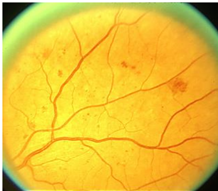
Standard photograph 2A , the standard for hemorrhages/microaneurysms. Eyes with severe NPDR have this degree of severity of hemorrhages and microaneurysms in all 4 midperipheral quadrants.

Severe nonproliferative diabetic retinopathy (NPDR): Using the 4-2-1 rule, the presence of at least one of the following features: (1) severe intraretinal hemorrhages and microaneurysms, equaling or exceeding standard photograph 2A, present in 4 quadrants; (2) venous beading in 2 or more quadrants (standard photograph 6A); or (3) moderate IRMA equaling or exceeding standard photograph 8A in 1 or more quadrants.